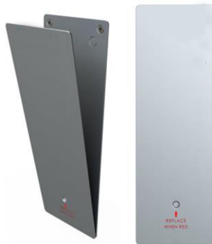
P-Hold PUSH PLATE Antibacterial Handle Plates (lasts 12 months)