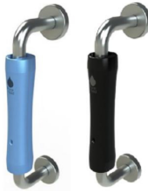
P-Hold PULL Antibacterial Door Handle Covers (lasts 6 months)