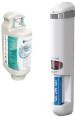
P-Hold PRO Gel Dispenser Door Handles (provides 2000 gel dispenses)