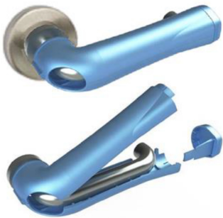
P-Hold LEVER Antibacterial Handle Covers (lasts 6 months)