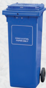
120/140 Litre Bin Locked with slot and deflector plate

Our secure lockable bins and containers are available in various sizes, shapes and styles, and have been designed to keep confidential material secure until it is shredded.