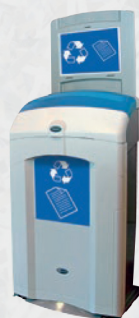
Executive Bins Various styles and sizes available