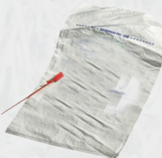
Nylon Sack & Security Seal Paper sacks also available