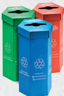
Cardboard Bin /Bag Holder