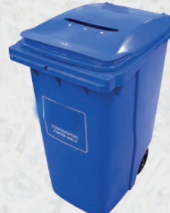
360 Litre Bin Locked with slot and deflector plate