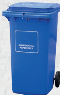
240 Litre Bin Locked with slot and deflector plate