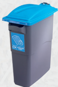
Desk Side Bins Various styles and sizes available