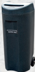
180 Litre Bin Locked with slot and deflector plate