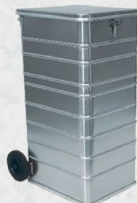
Metal Bins Various styles and sizes available