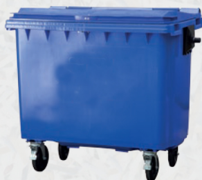
660 Litre Bin Lockable and drop front available