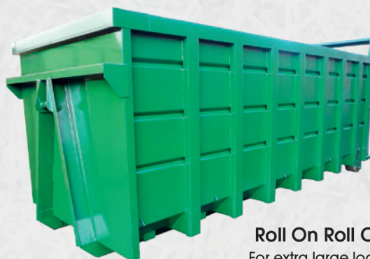
Roll On Roll Off Skip For extra large loads a skip can be supplied