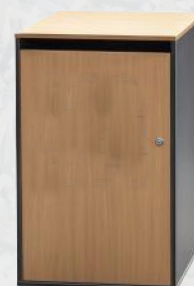
Large Sack Cabinet Available in various colours. Beech as standard